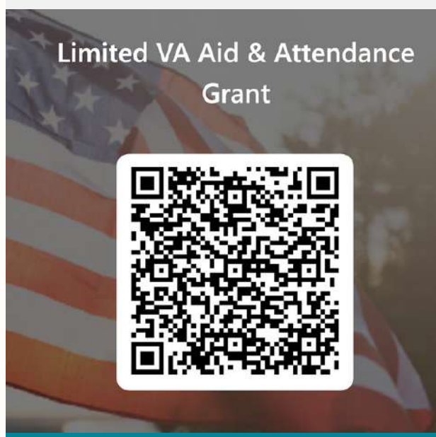
Grant Application Apply at: <u>seniorhousingrelief.org</u>